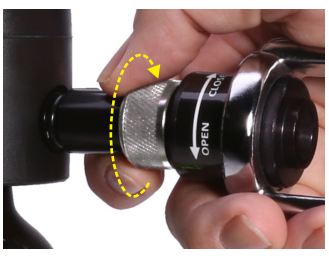
(4) Turn bleed ring to closed position.