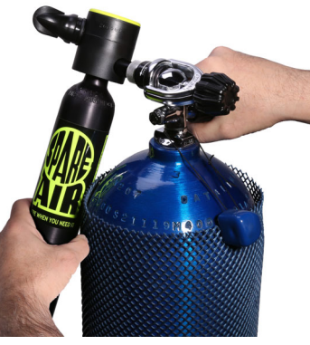
(6) Support Spare Air Cylinder. Open SCUBA cylinder very slowly.