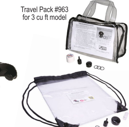
Protect regulator threads