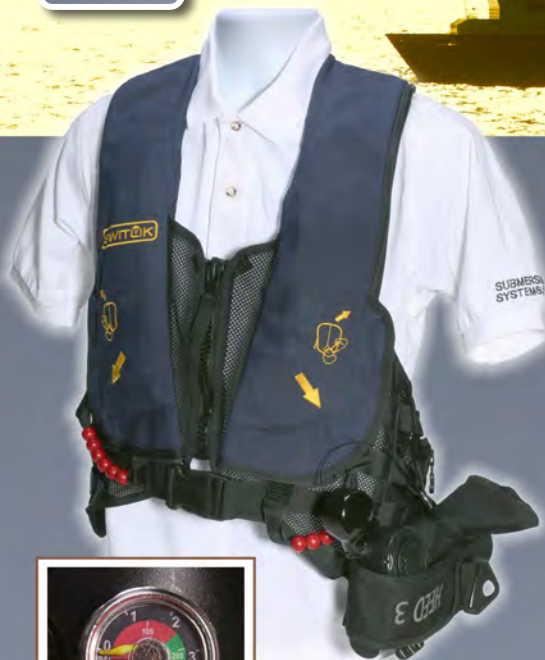
Switlik X-Back Air Crew Life Vest with attached HEED 3